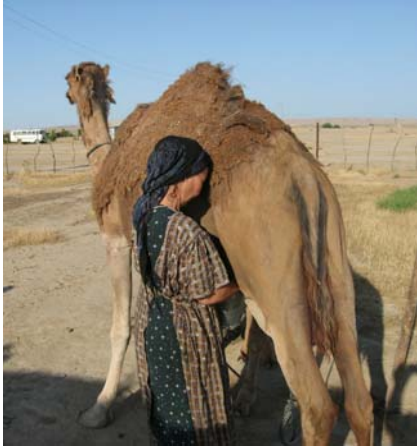
Turkmenistan women milking a camel. Camel milk is allowed to age/ferment in two-liter pop bottles.